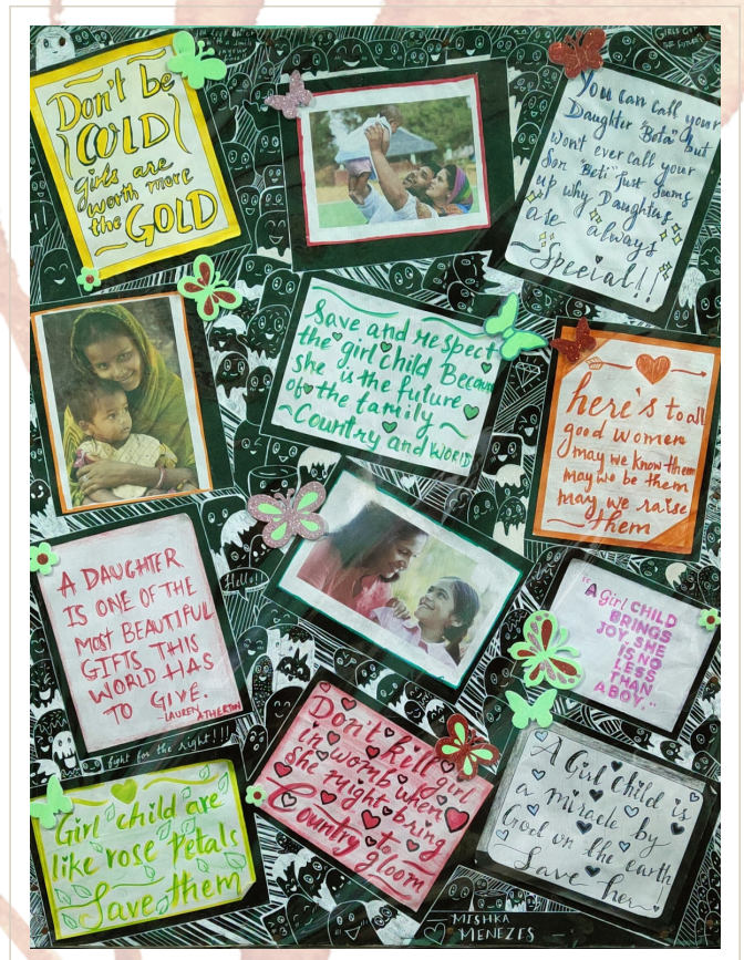
POSTER PRESENTATION AT BAILANCHO EKVOTT, MARGAO OSC CENTER IN SOUTH GOA TO DISSEMINATE AWARENESS ON GENDER BASED VIOLENCE AGAINST WOMEN.