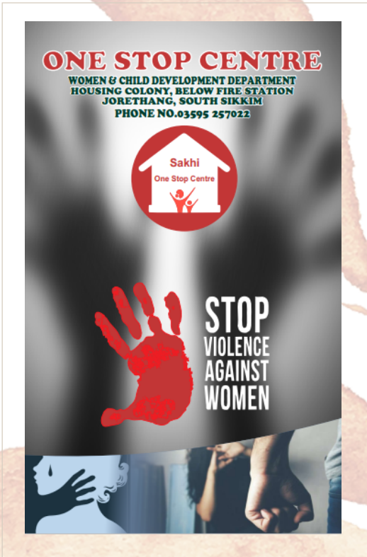
A PROGRESS BOOKLET CREATED BY JORETHANG DISTRICT, SOUTH SIKKIM THAT FOCUSES ON COLLATING THE CASE HISTORIES OF 'WOMEN FACING DISTRESS'.