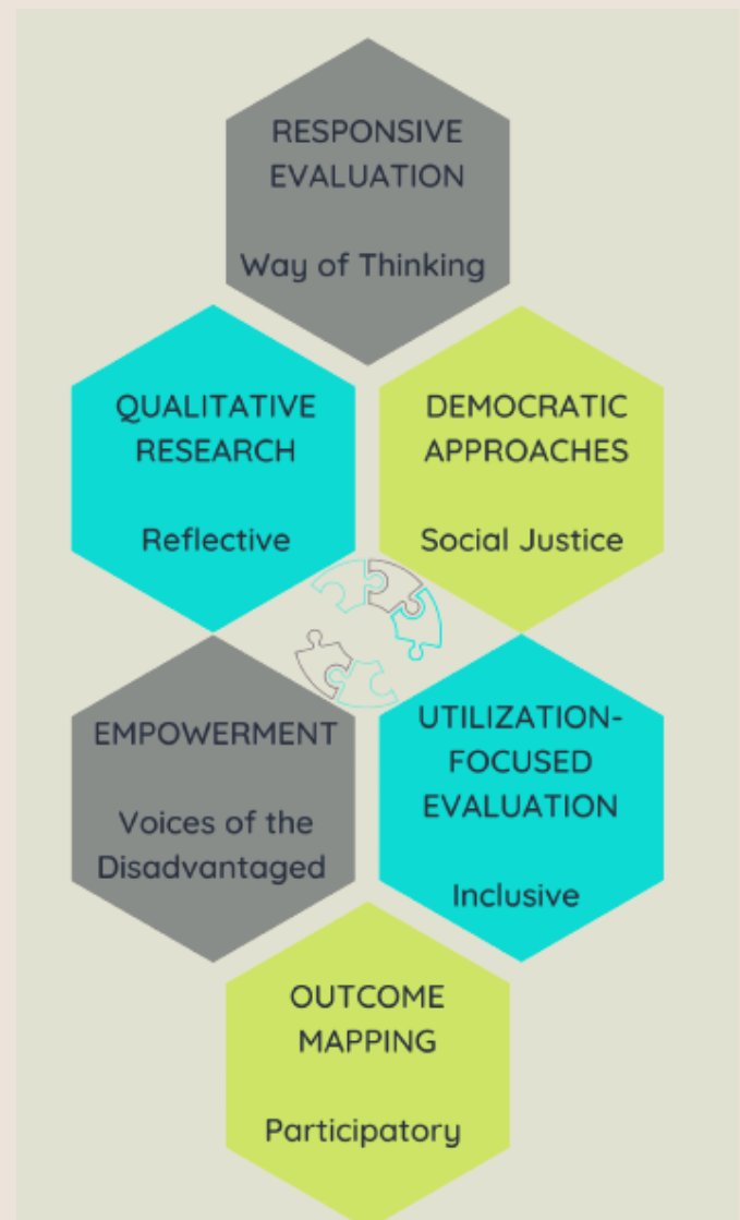
FIGURE 1: FEMINISTIC APPROACH OF EVALUATION IN CASE OF TRAUMA

Collaboration between clients and therapists, advocates and agencies, researchers and therapists, feminists and non-feminists is essential for understanding, preventing and treating violence. Disagreements can help refine our understandings and enable to plan better to reduce gaps between the need and the service being provided.