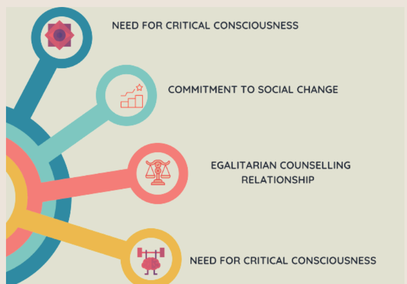
FIGURE 2: FEMINISTIC APPROACH IN PLANNING COUNSELLING AND PSYCHOTHERAPY FOR TRAUMA