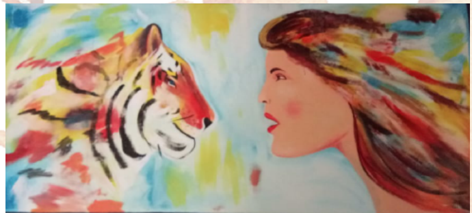
PAINTINGS FROM NANDED DISTRICT, MAHARASHTRA TO PORTRAY COURAGE, RESILIENCE AND FREEDOM AMONG WOMEN.